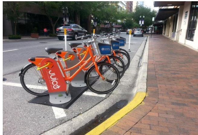
Figure 2. A Hybrid Bike Share Station in Orlando, FL

Hybrid bike share stations are composed of branded docks that are designed for smart bikes to easily lock to. They do not have any electrical components and do not require a power source. As a result, they are cheaper and more flexible than traditional bike share docks, allowing for a higher dock to bike ratio at the same or lower cost. The flexibility of the stations also makes it easier to find suitable sites. For example, stations can be sited between the tree wells on a sidewalk, without the costly expense of bridging a power source between the docks. Optional additional station components include signs and ticketing kiosks (requires a power source).