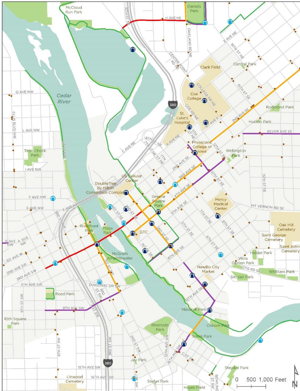
Figure 3: Recommended Station Locations